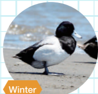
Winter Greater Scaup