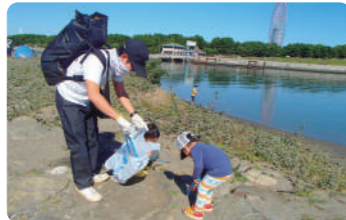
Beach Clean All year round

You can enjoy catching shellfish and crabs on the tidal flats, as well as birdwatching. We also hold wildlife watching event at various times. *Please release any creatures you caught" after the observation.