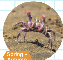
Spring - Autumn Sand Bubbler Crab