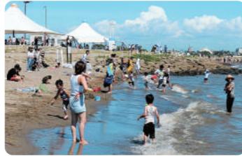
Sea Swimming Mid July to late August

At low tide, the tidal flats form a great expanse where visitors can dig for clams. You might find clams and crabs.