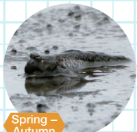
Spring - Autumn Mudskipper