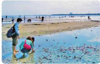
Clam Digging April to June

Kasai Marine Park runs lots of different activities with the help of local NPOs and other groups, including passing down the culture of areas where people live with the sea ( sato-umi ) and teaching people about the environment. Come and join us!