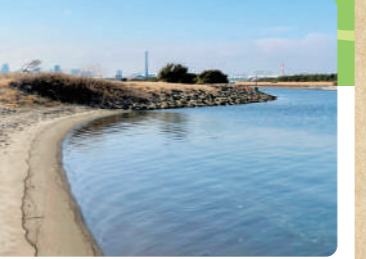
A Kasai Nagisa Bridge