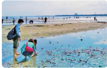
Clam Digging April to June

Kasai Marine Park runs lots of different activities with the help of local NPOs and other groups, including passing down the culture of areas where people live with the sea ( sato-umi ) and teaching people about the environment. Come and join us!